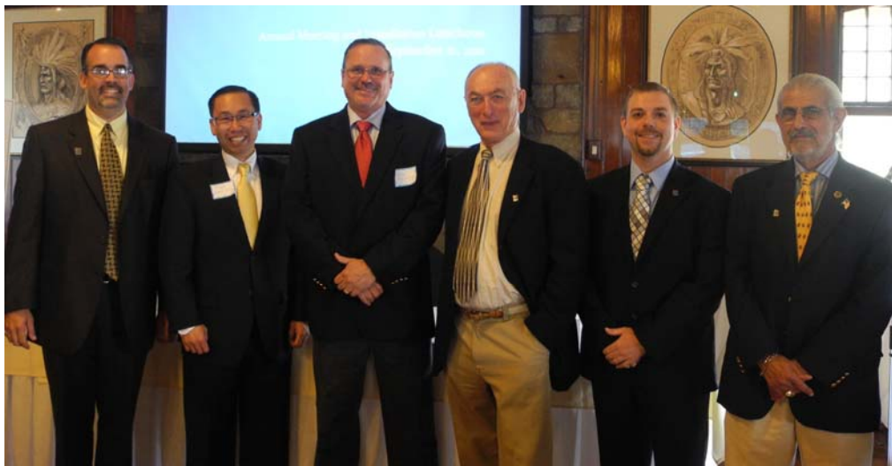
Mayor Fung and Luncheon Guests

We Gratefully Acknowledge Our Generous Sponsors: