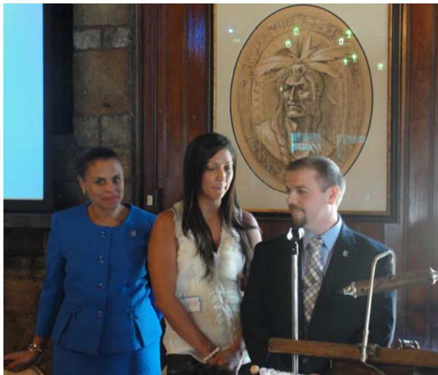
Leadership Academy Awardees