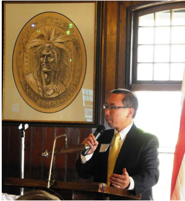
Mayor Allan Fung brings greetings from the City of Cranston.