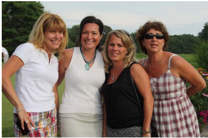
Golf Tournament Volunteers